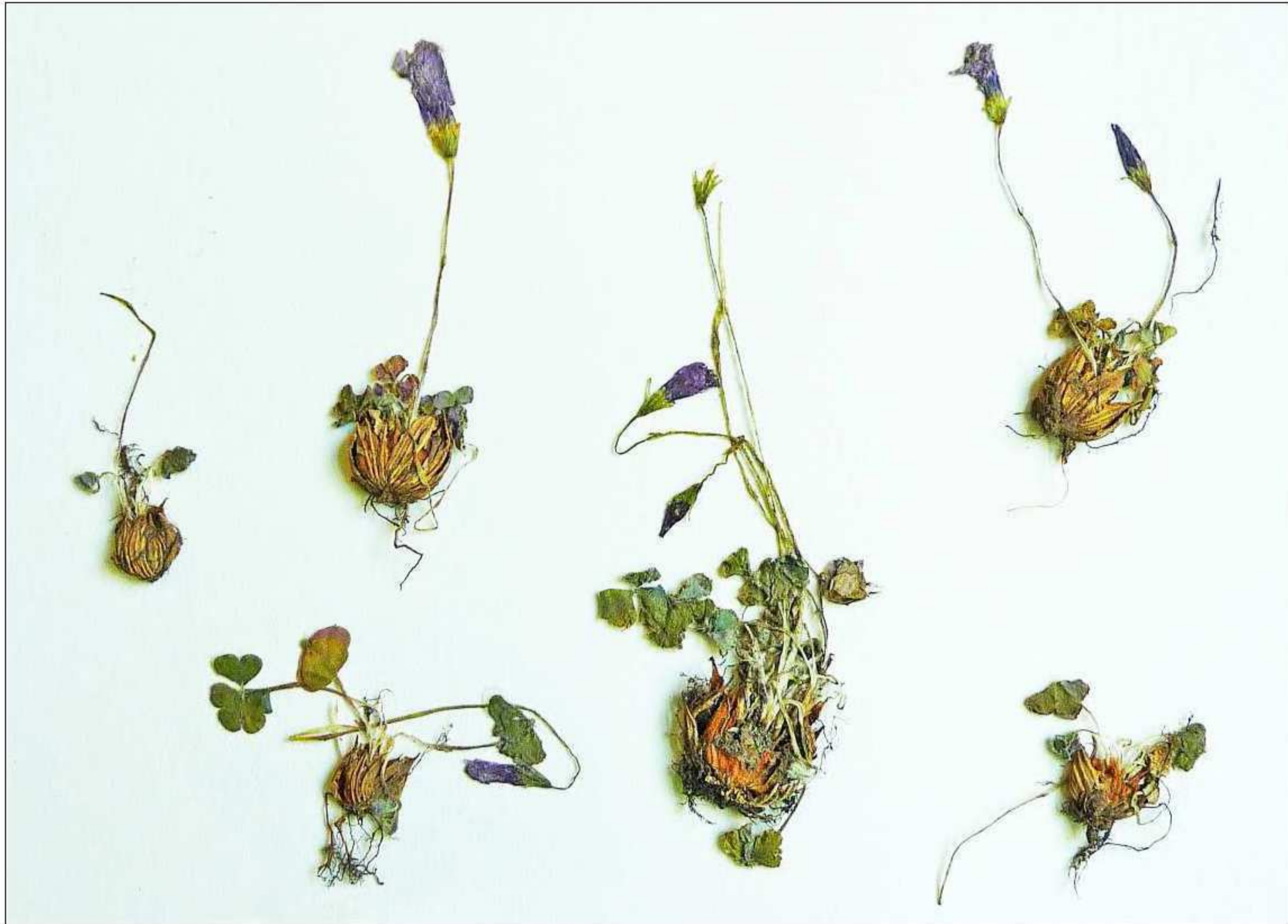
Figure 2. Oxalis hispidula collections from Baldwin County, Alabama. Top: Horne 1957 (BRIT). Right: Horne 1960 (BRIT).